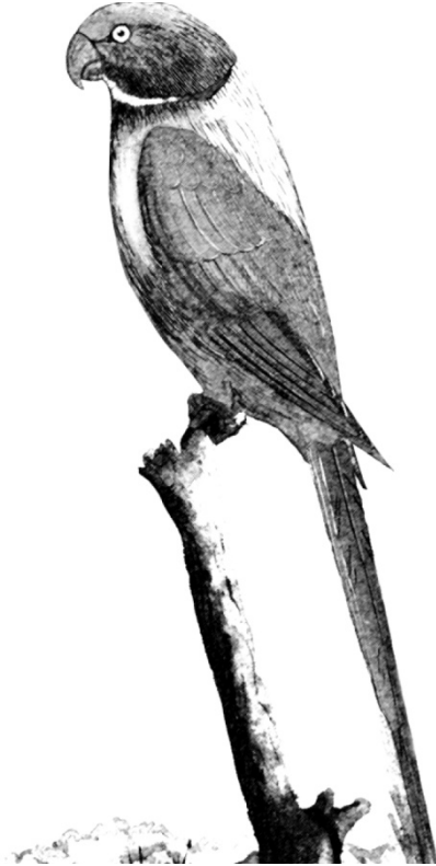
Malabar Parakeet

This is a tour specifically designed to sight all the endemics of the Western Ghats as well as most of the South Indian endemics. The tour is 15 days of intense birding. The tour covers the Dr Salim Ali Bird Sanctuary at Thattekkad, Periyar, Munnar, Top Slip, Ooty, Masinagudi, Ranganthittu & Kokre Bellur. Best time to visit would be September to April.